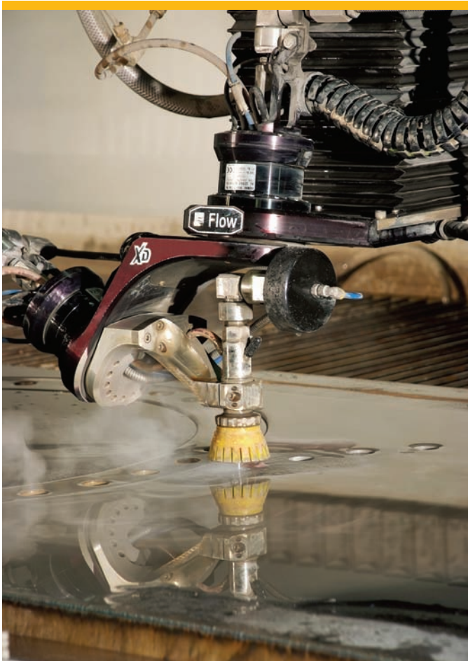
The powerful 94,000 psi (100 HP) HyperJet intensifier pump reduces cutting time by half.