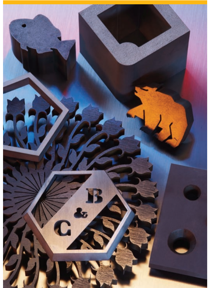
A few examples of some of the zero taper intricate parts that can be achieved with the Dynamic XD Waterjet.

Our extensive trucking fleet provides flexibility and on-time service.