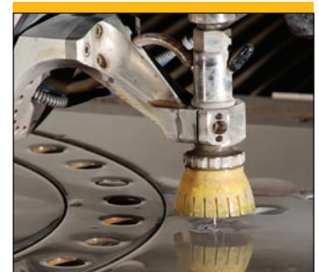
The Waterjet precision cutting requires no secondary finishing processes.